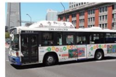
Artmile Mural Exhibition at TICAD 5 (Artemile bus)