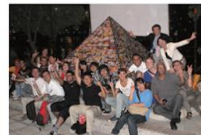
Artmile MURAMID Exhibition in Egypt