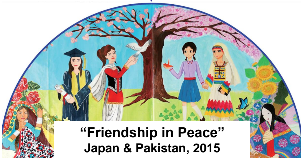
“Friendship in Peace” Japan & Pakistan, 2015

5. Reflect the whole learning. Appreciate how one self has grown and changed.