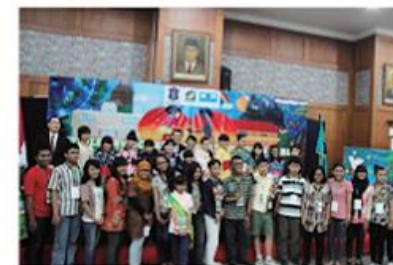
Artmile Environment Youth Summit in Indonesia