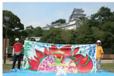
Mural painting event at World Cultural Heritage

JAM has done various activities including not limited to the AICL project.