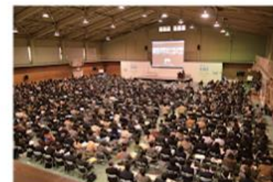
UNESCO World Conference on ESD