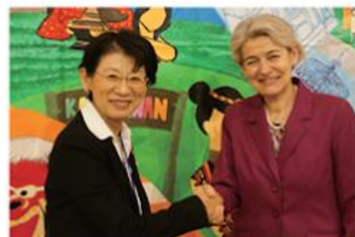
Artmile Mural Exhibition at UNESCO in Paris